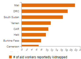
Aid workers reportedly kidnapped, by country, in 2022 to date

2022 Aid Worker KIKA Data by Insecurity Insight