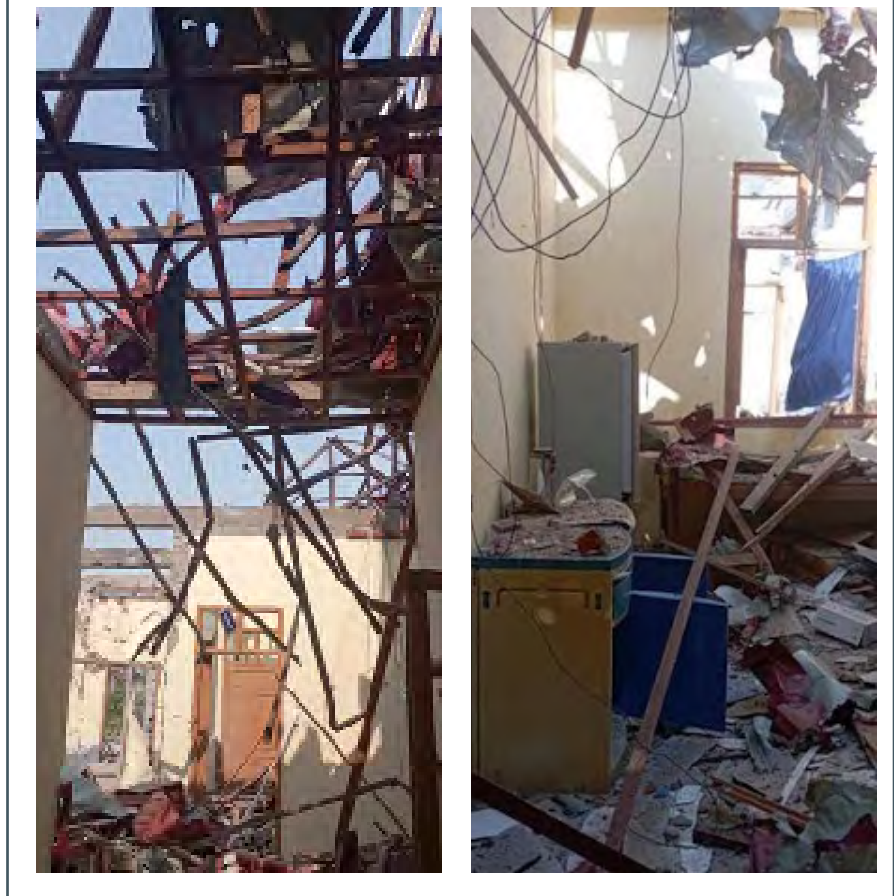
Figure 5: Air strikes on Saung Phwe Hospital, Yin Nwe village, Pekon township, Shan state, 25 April 2023

The military's blockade of opposition-controlled areas has also deprived displaced civilians of medical and humanitarian aid.