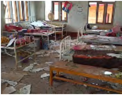
Figure 6: Saung Phwe Hospital, Pekon township, Southern Shan State, 25 April 2023